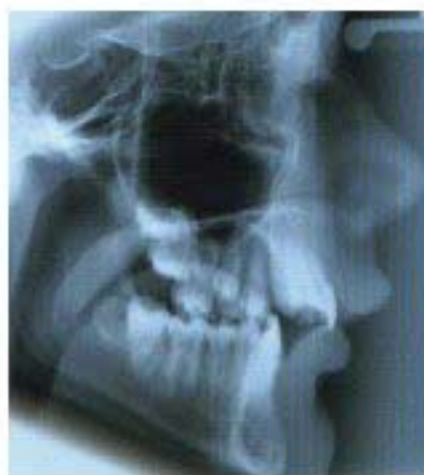
X-ray of the teeth and jaws